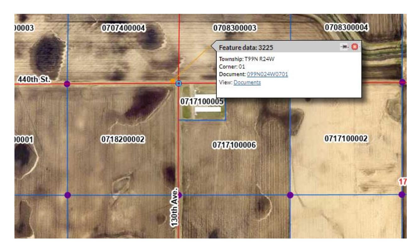
Right click "Documents" then click "Open link in new tab" to view all corresponding documents.

You are then able to click and open the PDF documents found in that results tab.